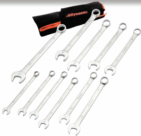
D074224 11 Piece Metric Satin Finish Combination Wrench Set - Contractor Series