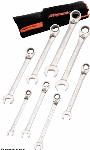
D076601 8 Piece SAE Reversible Combination Ratcheting Wrench Set (15° Offset)