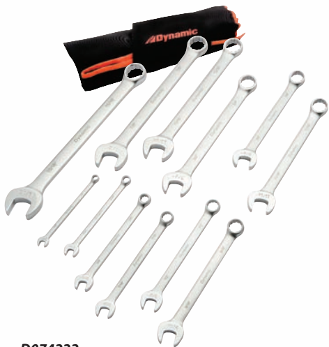
D074222 12 Piece SAE Satin Finish Combination Wrench Set - Contractor Series