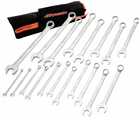
D074223 19 Piece Metric Satin Finish Combination Wrench Set - Contractor Series