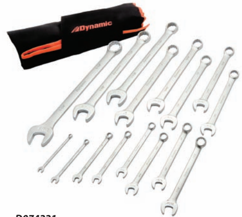
D074221 16 Piece SAE Satin Finish Combination Wrench Set - Contractor Series