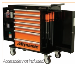
Accessories not included.