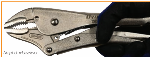
No-pinch release lever