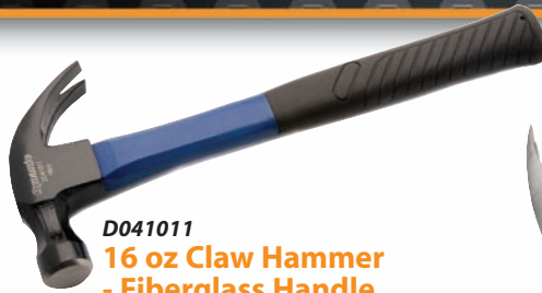
D041011 16 oz Claw Hammer - Fiberglass Handle List Price: $28.26