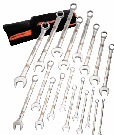
D074203 19 Piece Metric Combination Wrench Set • 6-24 mm List Price: $259.64 $170.99