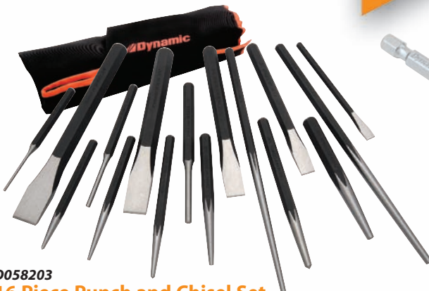
D058203 16 Piece Punch and Chisel Set