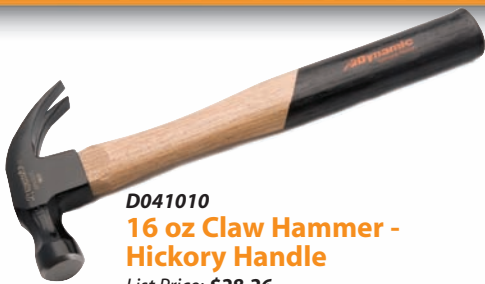
D041010 16 oz Claw Hammer - Hickory Handle List Price: $28.26