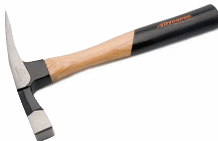
D041130 24 oz Bricklayer's Hammer - Hickory Handle List Price: $30.59