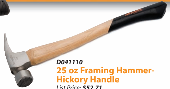
D041110 25 oz Framing Hammer - Hickory Handle List Price: $52.71