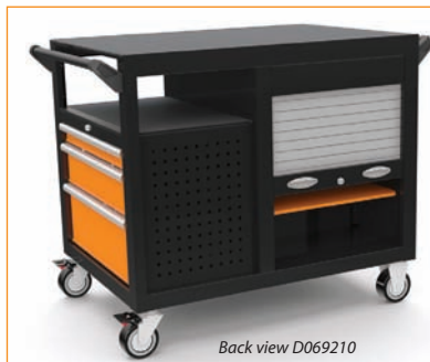
Back view D069210