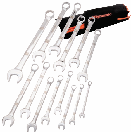
D074201 14 Piece SAE Combination Wrench Set • 3/8"-1 1/4" List Price: $286.15 $188.99